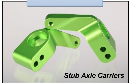
Stub Axle Carriers